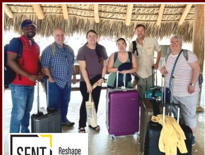
2025 Dominican Republic Team