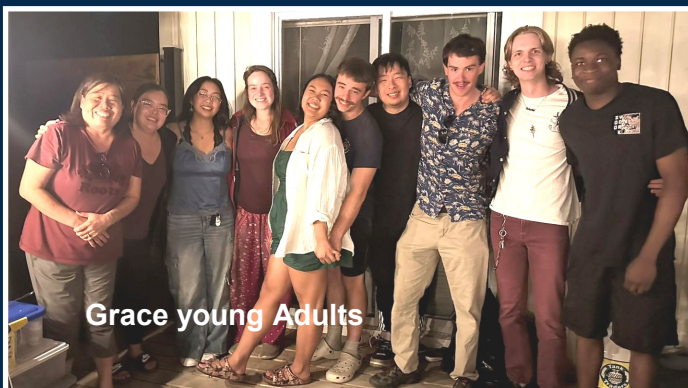
Grace young Adults