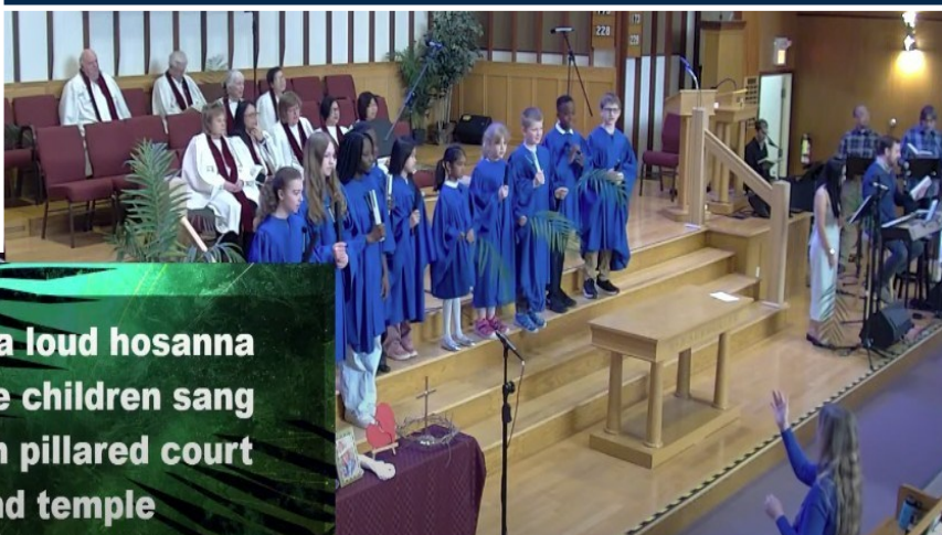
Hosanna loud hosanna the little children sang Through pillared court and temple