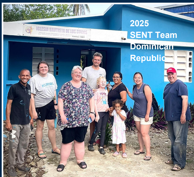
2025 SENT Team Dominican Republic