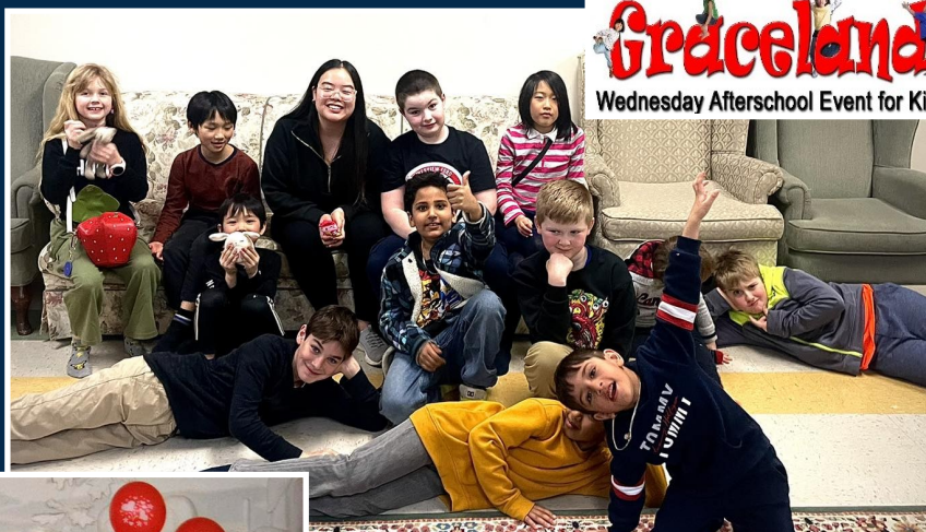
Graceland Wednesday Afterschool Event for Kids