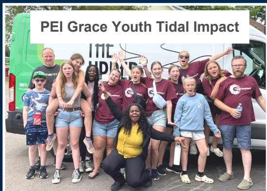
PEI Grace Youth Tidal Impact